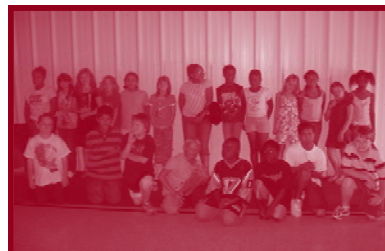
3rd & 4th grade "B" class enjoyed a pizza party!