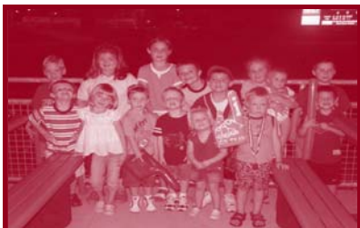
Kindergarten "A" class at a WV Power baseball game!