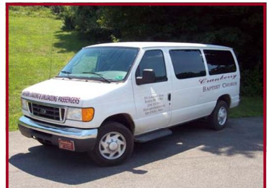
NEW CHURCH VAN!